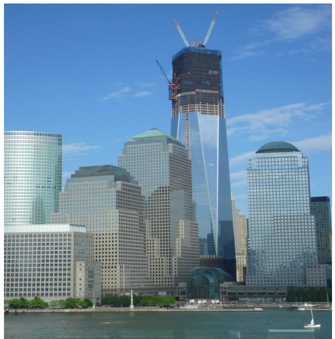
For those who have not seen it yet, here is the Freedom Tower, going up where the World Trade Center used to be.