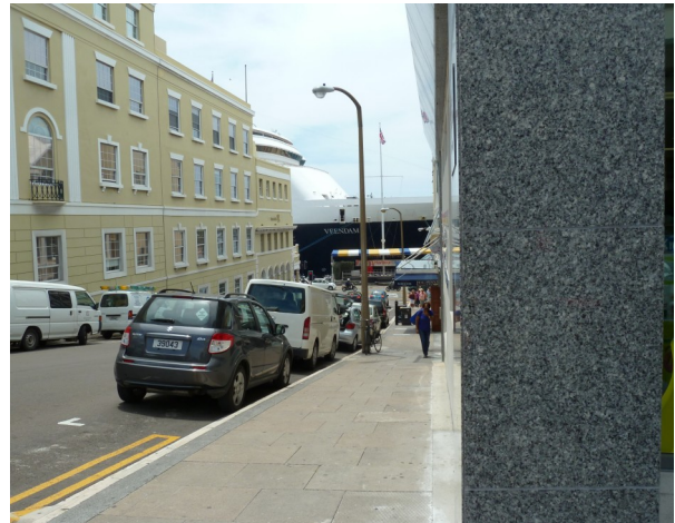
I was away last month. Here is the bow of our ship docked in downtown Hamilton, Bermuda

For details on these and other news stories, visit the CQ Newsroom by going to the CQ magazine website at < www.cq-amateur-radio.com > and clicking on the "CQ Newsroom" button.